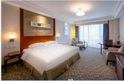
Ramada Beijing North