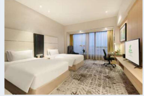
Holiday Inn Shanghai West