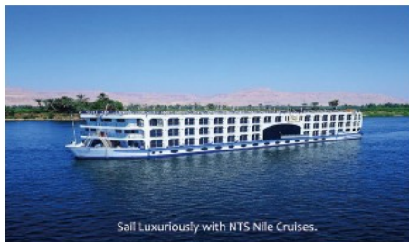
Sail Luxuriously with NTS Nile Cruises.