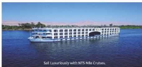
Sail Luxuriously with NTS Nile Cruises.