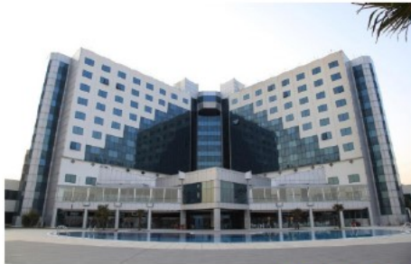
Kolin Hotel Canakkale