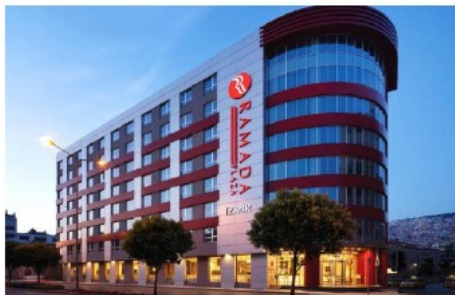
Romada Plaza Hotel