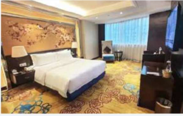
Chengdu Anyee Xinliang Grand Hotel ★★★★★