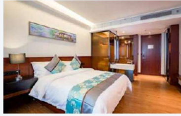
Best Western Plus Zhangjiajie ★★★★★