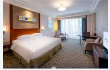
Ramada Beijing North ★★★★★