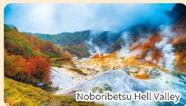
Noboribetsu Hell Valley

Visiting: Hot spring town Noboribetsu, Romantic town Otaru, Central city Sapporo.