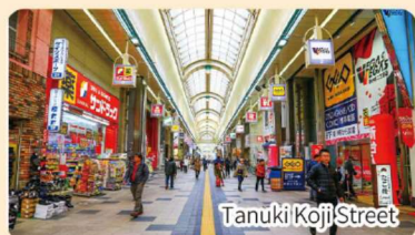
Tanuki Koji Street