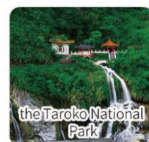
the Taroko National Park