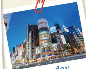
One-day Tokyo Tour