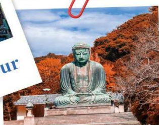
One-day Kamakura & Yokohama Tour