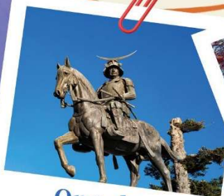
One-day Sendai Tour