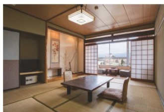
Heian Hot Spring Hotel ★★★★★