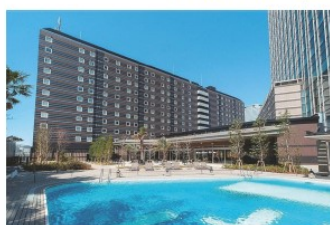
Tokyo Bay APA Resort ★★★★★