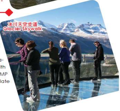
冰川天空步道 Glacier Skywalk